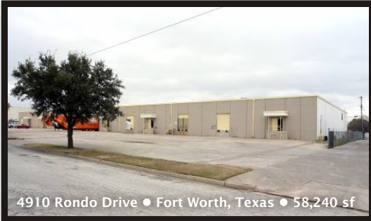
4910 Rondo Drive • Fort Worth, Texas • 58,240 sf