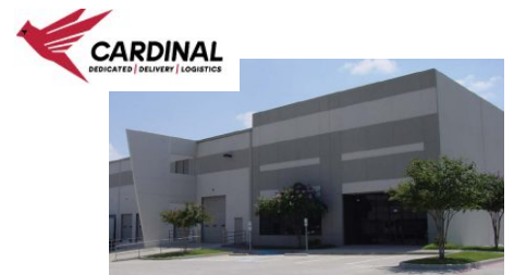
3115 GSW Parkway • Grand Prairie, TX

President/CEO of Bradford Companies. "These transactions reflect our firms' continual ability to meet our clients strategic real estate needs in the marketplace."