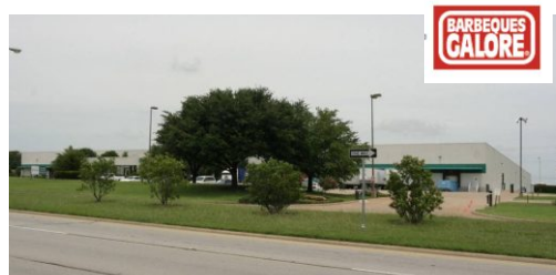
3001 E Pioneer Parkway • Arlington, TX